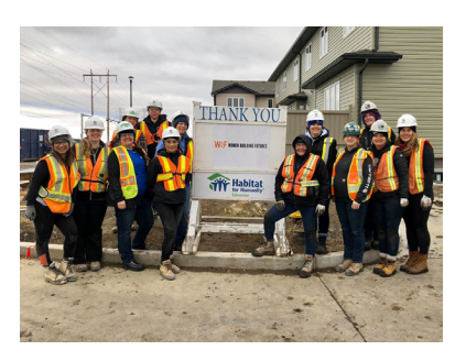
WBF team laced up steel toe boots to support building homes for Habitat for Humanity.