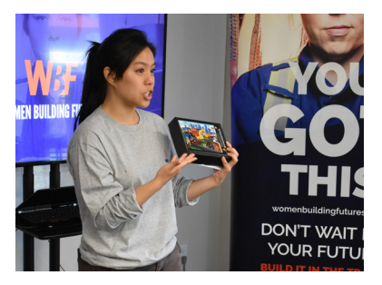
Invited to participate in the Gender Equality Network Canada, a unique three-year initiative to advance gender equality in Canada, hosted by the Canadian Women's Foundation.