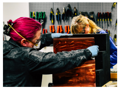
Approached to partner on major projects in Alberta Heartland & Northern Alberta to support training and hiring local women.