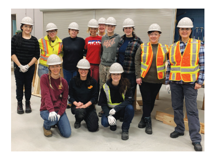
Building on the momentum of our inclusive workplace research, we were invited to partner on a construction readiness training program expanded to BC through LNG Canada Project.